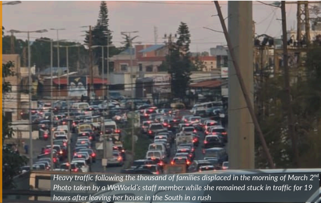
Heavy traffic following the thousand of families displaced in the morning of March 2 nd . Photo taken by a WeWorld's staff member while she remained stuck in traffic for 19 hours after leaving her house in the South in a rush

This Flash Update was prepared by WeWorld and Educo as members of CFA to report on the latest escalation of Israeli hostilities and humanitarian crisis in Lebanon (March 2 nd , 2026).