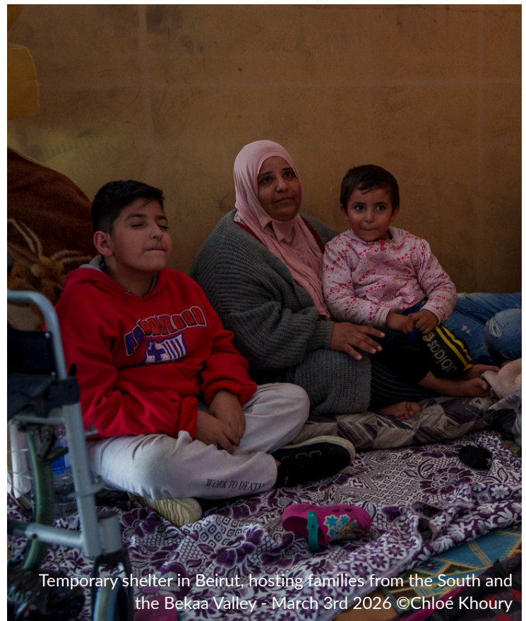
Temporary shelter in Beirut, hosting families from the South and the Bekaa Valley - March 3rd 2026

In the Bekaa, WeWorld will also procure fuel to maintain the operation of potable water and wastewater pumping stations , identified as a critical need amid the new waves of displacement. To complement these activities, EDUCO and WeWorld will provide Psychological First Aid (PFA), trauma-informed case management, community-based psychosocial support and referrals for high-risk cases , including unaccompanied and separated children and survivors of violence. EDUCO will support children's well-being and learning continuity during displacement through homework assistance, basic literacy and numeracy activities, the distribution of educational and recreational materials, and support to caregivers to promote children's protection and psychosocial well-being.