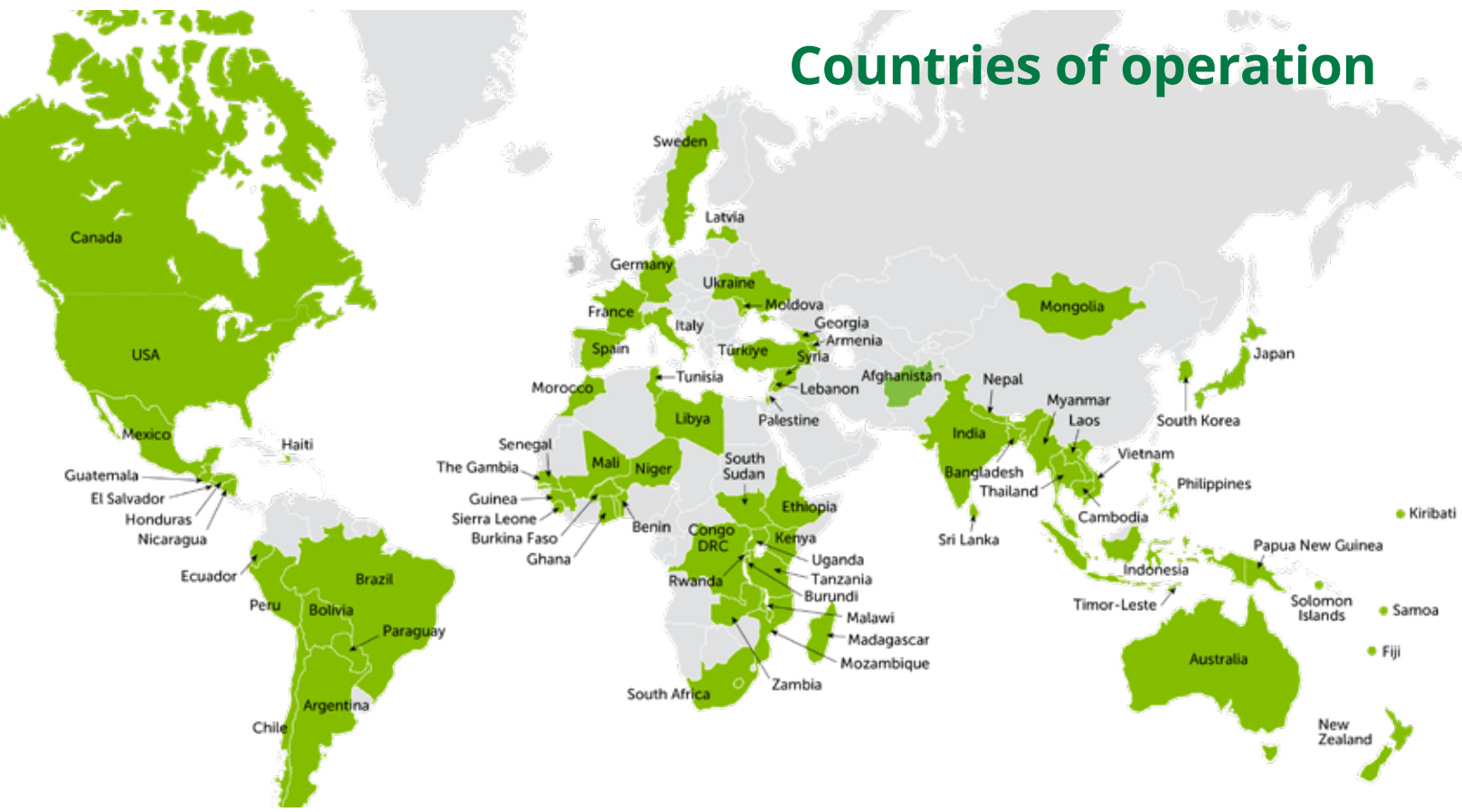
ChildFund Alliance members operate programs in 66 countries and have headquarter offices in Australia, Canada, France, Germany, Italy, Japan, New Zealand, South Korea, Spain, Sweden and USA.

Through our efforts, ChildFund Alliance harnesses the strength and creativity of children and young people to help them improve their lives and change the world.