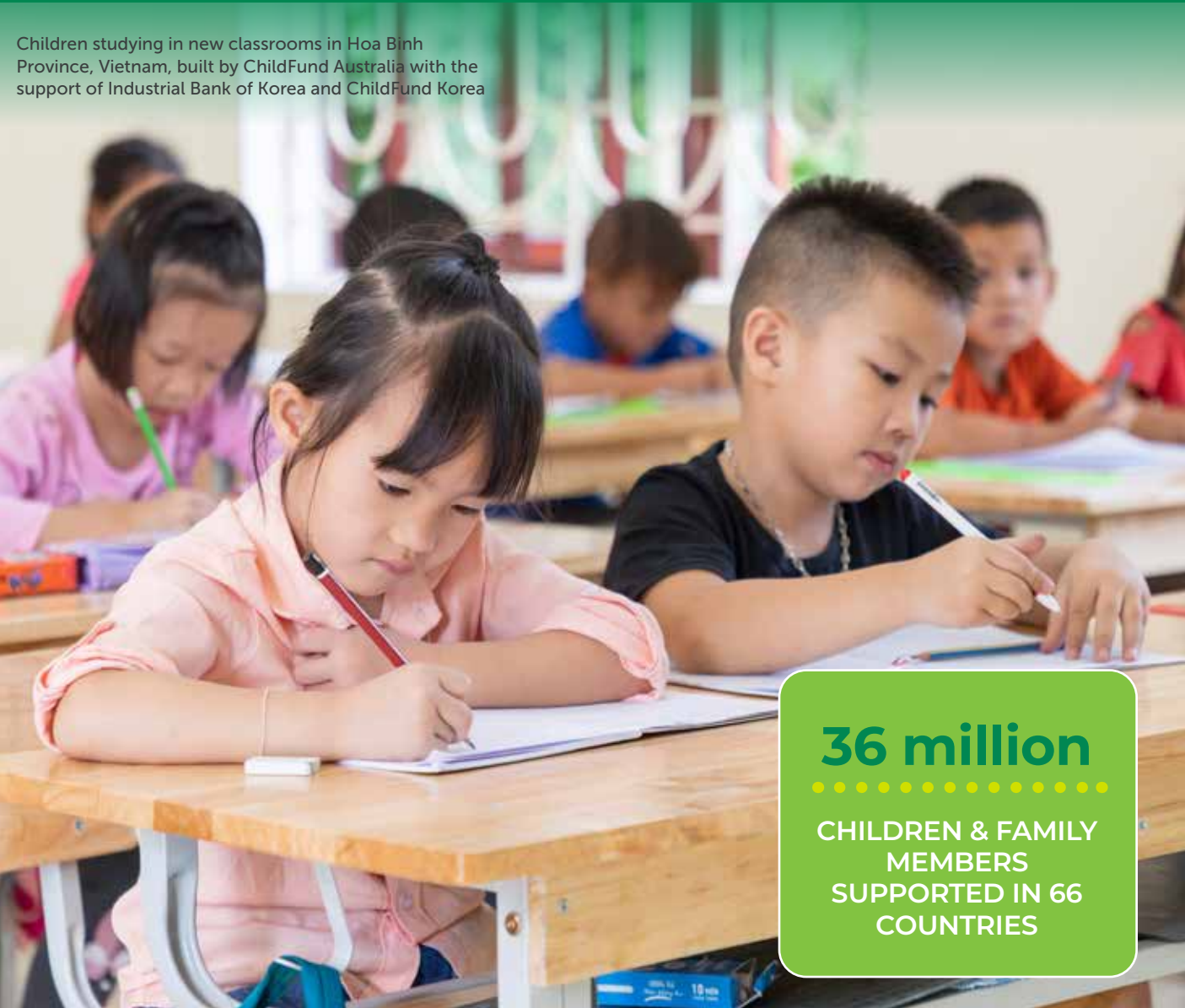
Children studying in new classrooms in Hoa Binh Province, Vietnam, built by ChildFund Australia with the support of Industrial Bank of Korea and ChildFund Korea

With 80 years of collective experience, and an annual investment in children of more than US$580 million, our commitment, resources, innovation and expertise serve as a powerful force to help children and families around the world transform their lives.