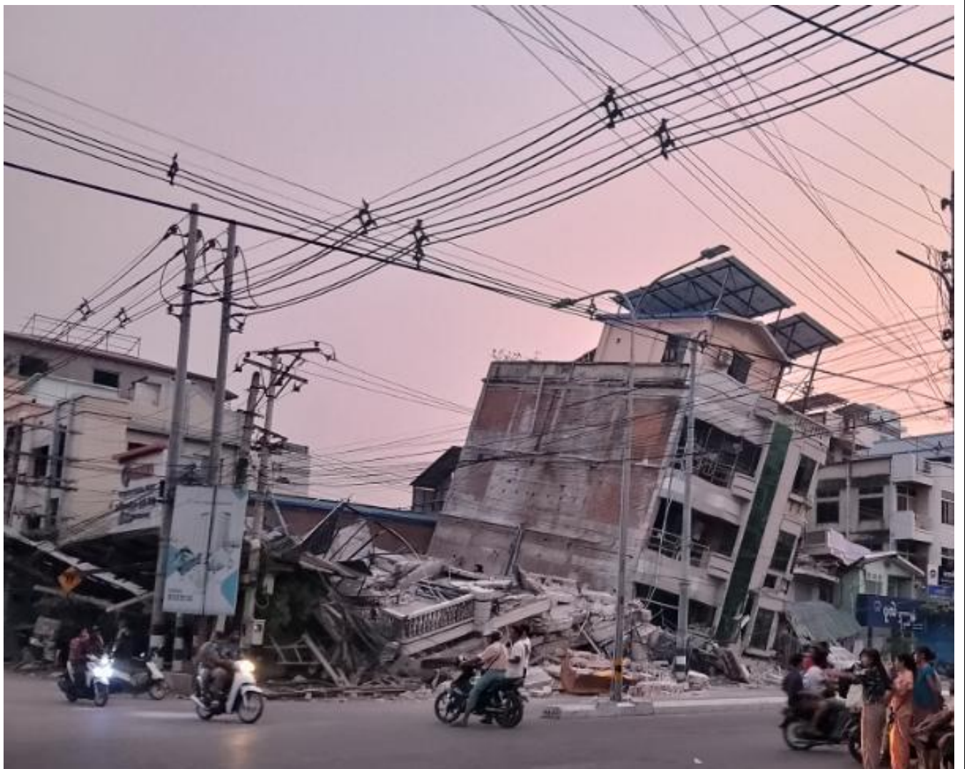
People travel past the rubble of collapsed buildings in Mandalay in Myanmar on March 31, 2025

This document outlines the emergency response carried out over the past two weeks by ChildFund Myanmar, the legal office of ChildFund Australia, since the devastating earthquakes that hit the country on 28.03.2025. It also outlines ChildFund Myanmar's strategy and operational framework to further guide and coordinate the next phases' interventions.