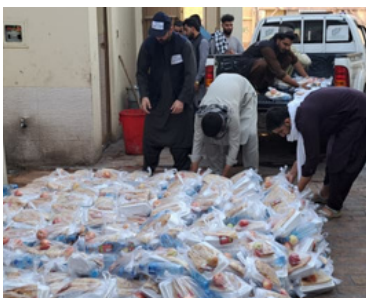
Food distribution operations, Kunar province - 07/09/2025

WeWorld, in collaboration with its national partner NCRO, began distributing ready-to-eat meals to affected people just in the aftermath of the earthquake. In total 10,500 meals were distributed , especially women and children were supported. WeWorld and its partner maintain a strong presence in the eastern region, and can rely on well-equipped and active offices in various Provinces.