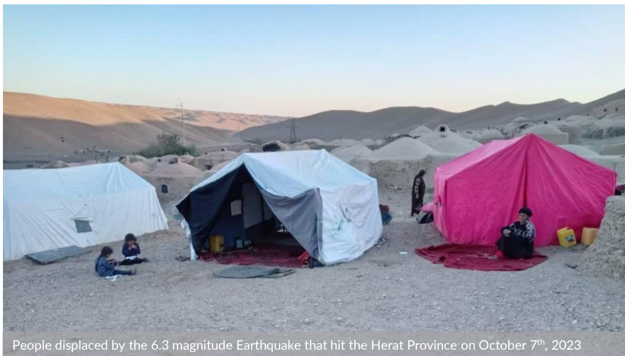
People displaced by the 6.3 magnitude Earthquake that hit the Herat Province on October 7 th , 2023