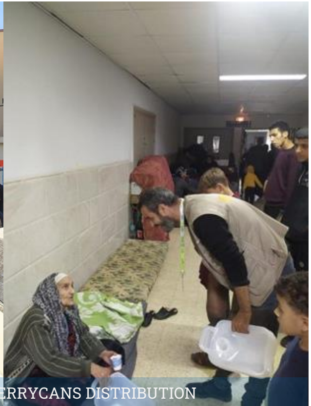
BOTTLED WATER AND JERRYCANS DISTRIBUTION