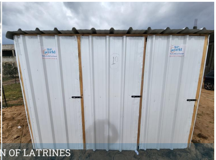
CONSTRUCTION OF LATRINES

Considering the acute water scarcity and the number of IDPs, the installation of dry latrines becomes imperative as a sustainable and resource-efficient sanitation solution, ensuring hygienic waste disposal without exacerbating the already critical water shortage.