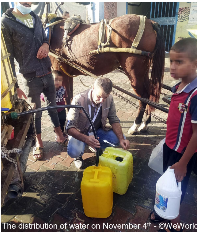
The distribution of water on November 4 th

On November 4 th and 8 th , WeWorld's team in Rafah was able to collect and distribute fresh water and Non Food Items (NFIs) to 6,000 internally displaced people, the majority of them women and children. Due to the absence of fuel and proper means of transportation, the delivery was done with carts pulled by donkeys and horses.