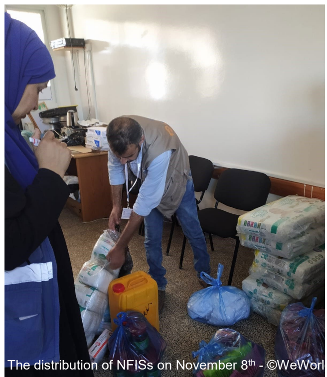
The distribution of NFISs on November 8 th

The following response will start with procurement and shipment of top-priority humanitarian aid (e.g., drinkable bottled water of various sizes). The distribution plans will be set up and put in place to ensure coordination with first responders and current organisational capacities, toward rapid distribution and