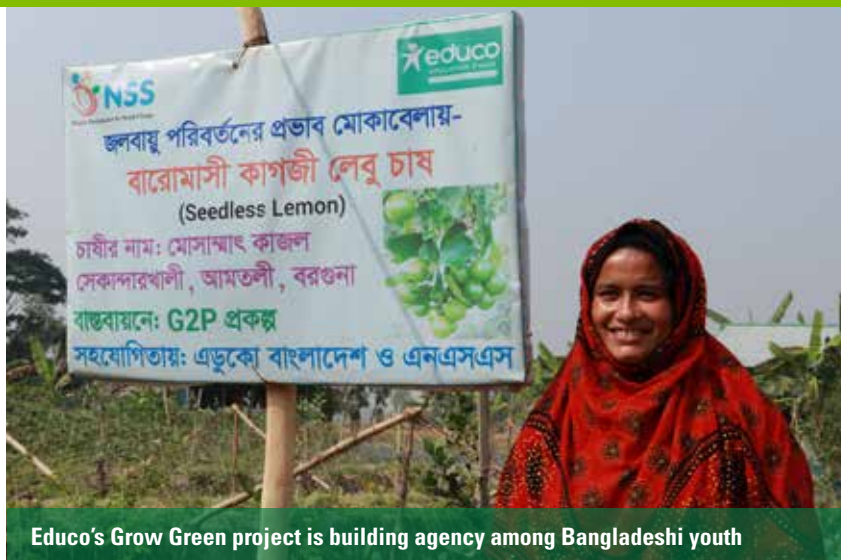
Educo's Grow Green project is building agency among Bangladeshi youth

This included talking to farmers, local businesses, and government officials to learn about adaptation plans. They also organized a wide range of awareness-raising activities with family, schools, and at the community level, often incorporating drama.