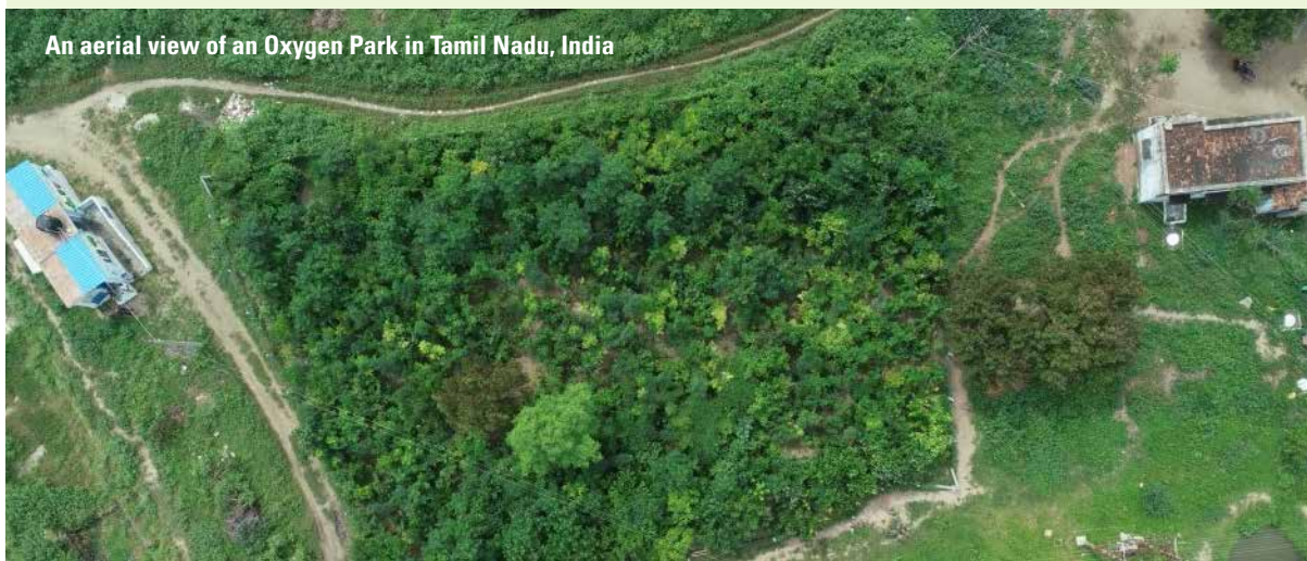
An aerial view of an Oxygen Park in Tamil Nadu, India

Initiatives such as these support young people to translate information into action and to start initiating projects that could provide dividends for years to come.