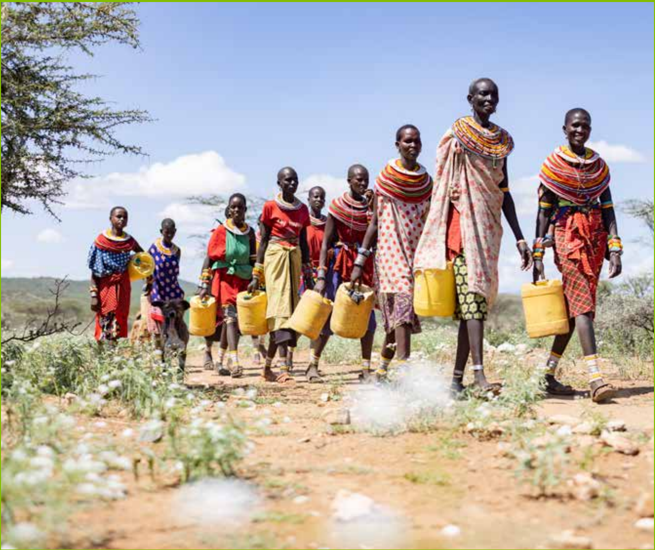
Samburu women in Kenya collect water from a new borehole constructed by ChildFund. Using a solar powered pump, this ensures year-round access to safe, clean water.