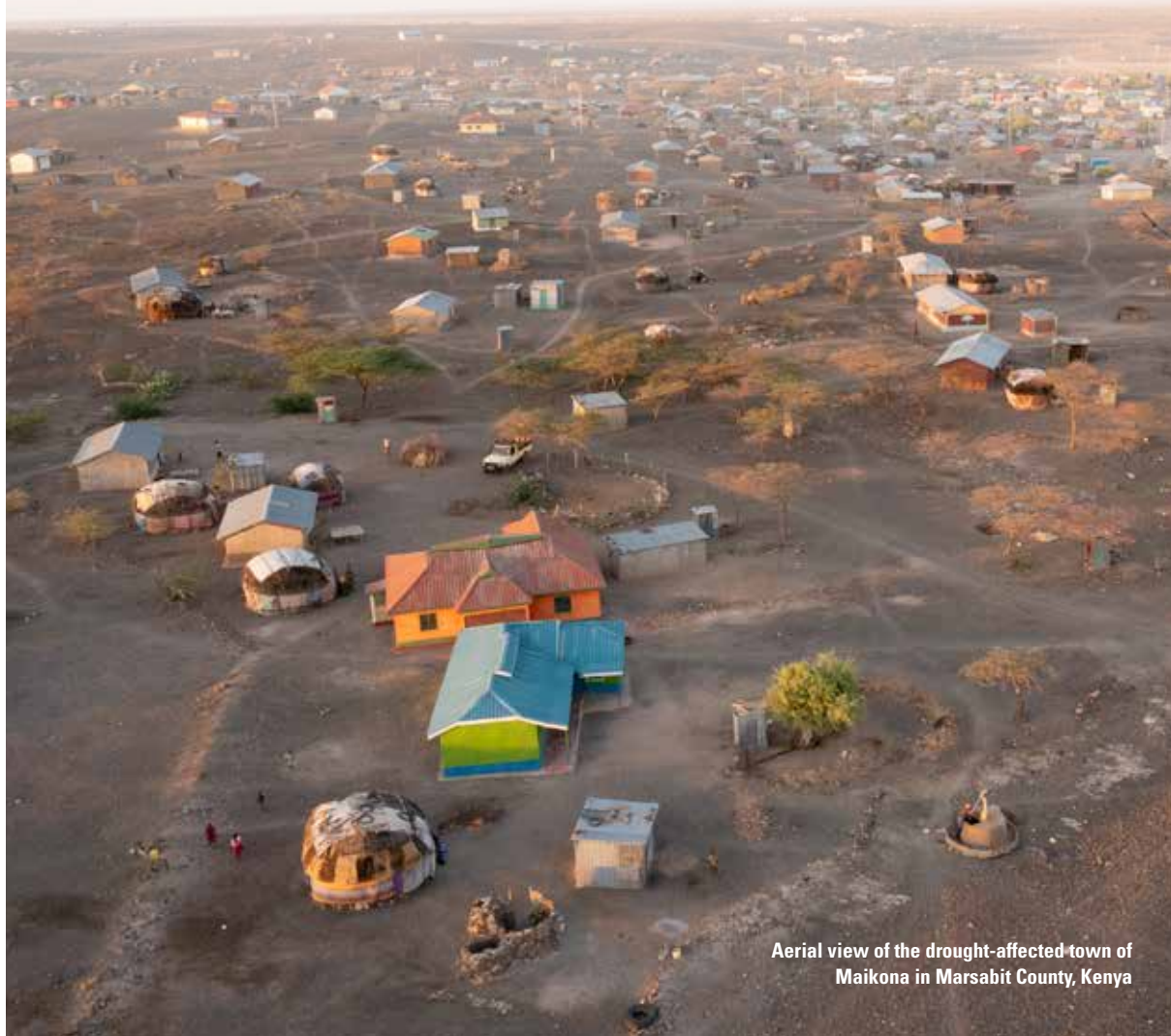
Aerial view of the drought-affected town of Maikona in Marsabit County, Kenya

This brief reflects input from across ChildFund Alliance members. Case studies within the brief offer insights into this complex issue, in addition to recommendations for potential development of joint projects among Alliance members and country offices.