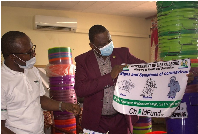
Caption: IEC Material donated to the Ministry of Trade and Industry