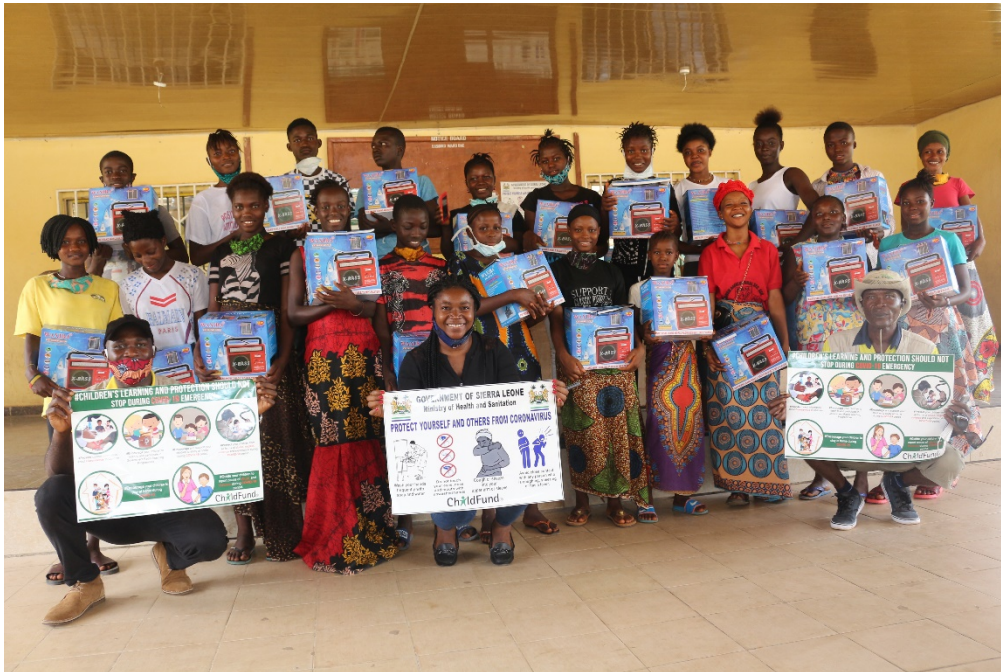
Caption: cross-section of children (with ChildFund and LP staff) posed with their radios and IEC materials in Koinadugu