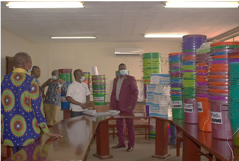
Caption: Donation of IPC materials to the Ministry of Trade and Industry for use by market women

ChildFund on May 13 2020 donated 360 veronica buckets and wash and 100 IEC (COVID-19) poster to the Ministry of Trade and Industry for use by Market Women in Freetown.