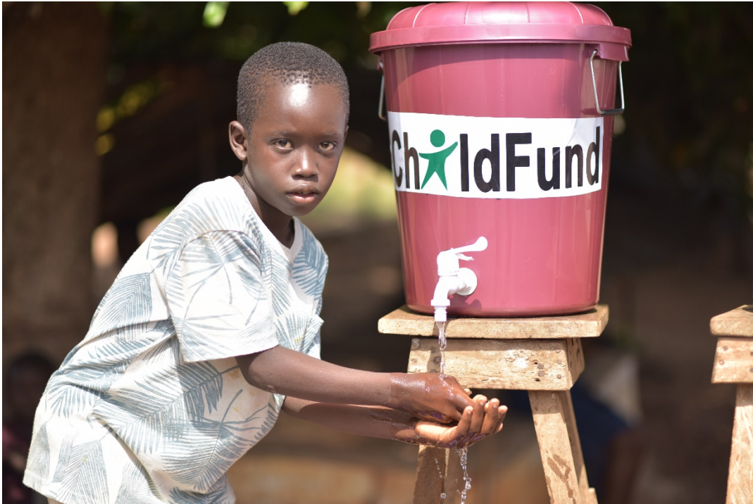
Photo caption: Veronica buckets donated by ChildFund being utilized

ChildFund on May 13 2020 donated 360 veronica buckets and wash and 100 IEC (COVID-19) poster to the Ministry of Trade and Industry for use by Market Women in Freetown.