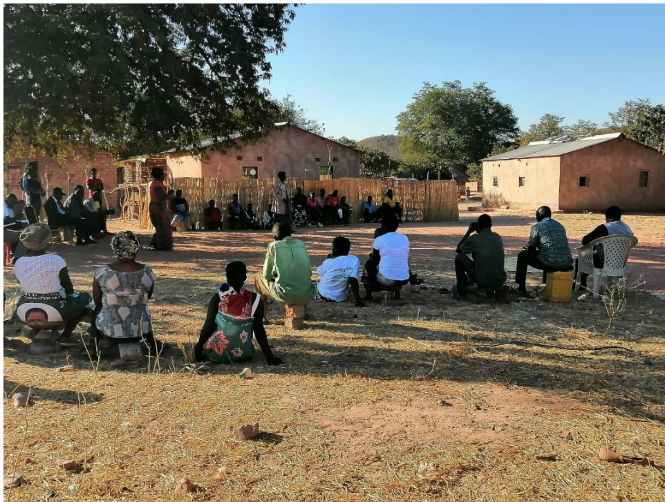
Figure 1: Sensitizing Community Members on COVID-19 in Luangwa District