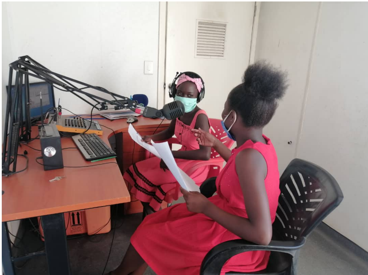
Figure 2: Children on Radio Explorer Talking about Child Marriage and the need to Protect children especially the Girl Child in Luangwa District

ChildFund has continued engagements with children on child protection. ChildFund has continued paying for radio programmes on community radio stations where children advocate for a violent free community.