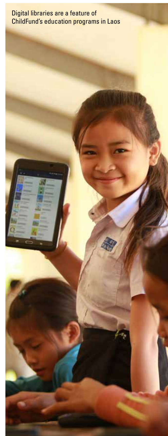
Digital libraries are a feature of ChildFund's education programs in Laos

Understanding how the digital world works, even where a child's ability to access it is limited, is still essential to preventing harmful situations from occurring. It also helps ensure young people are equipped with the necessary tools so they can protect themselves once they do venture into digital environments. 17